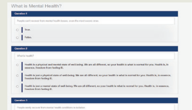
Final exam - certificates provided.

One in four people experience some form of mental health issue over the course of a year. They may experience mental health issues to varying degrees.