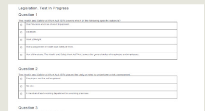
Final Exam – Certificates Provided.

There is no set layout or template for risk assessment forms, so many versions are available. Find a template that suits your organisation.